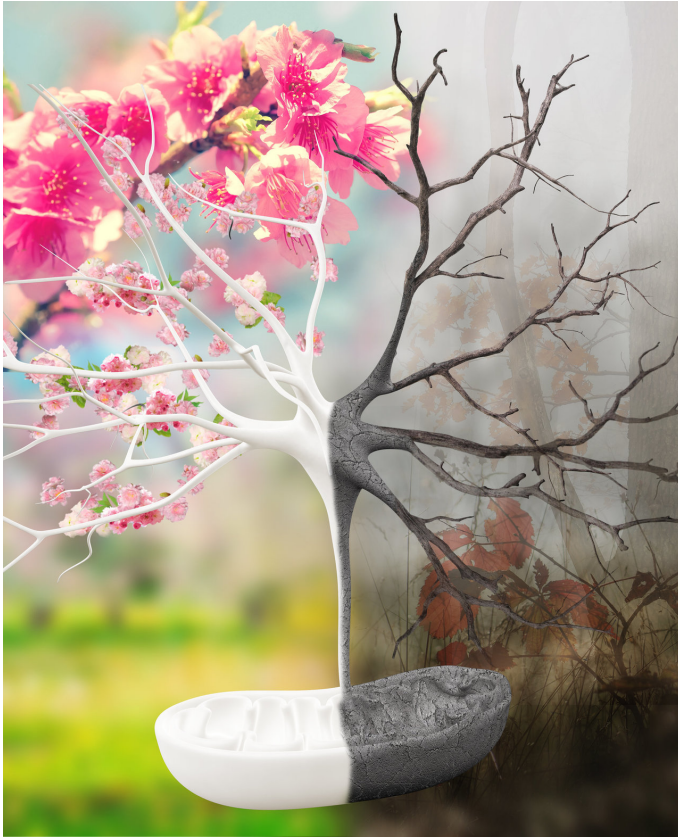
Illustration represents a youthful neuronal mitochondrion with normal energy production (left side) juxtaposed with an aging mitochondrion with dysfunctional energy production (right side). Credit: Veronika Mertens

energy needs. "If you have an old car with a bad engine that sits in your garage every day, it doesn't matter," Mertens says. "But if you're commuting with that car, the engine becomes a big problem."