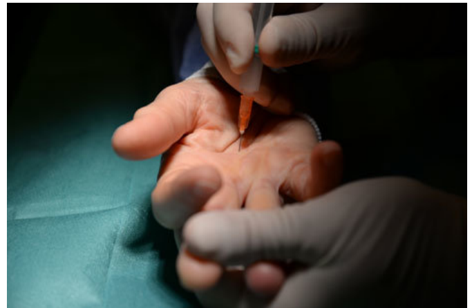
Needle fasciotomy.