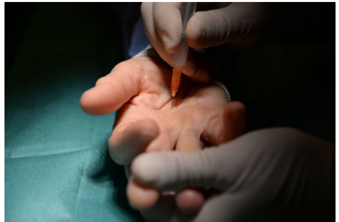
Needle fasciotomy.