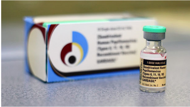
Human papillomavirus (HPV) vaccine.

It's nearly a decade since the human papillomavirus (HPV) vaccine was first introduced in the UK to help protect against the virus that causes most cases of cervical cancer. But until now, it has only been routinely offered to girls.