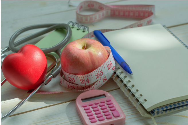
A healthy weight means a healthy heart.

Your body mass index (BMI) indicates whether you are within a healthy weight range based on your height. Having a higher BMI – meaning more weight relative to height – can increase your risk of developing heart disease, cancer and type 2 diabetes. While BMI is partly determined by your environment and lifestyle – including your diet and how much you exercise – our genes also play a role.