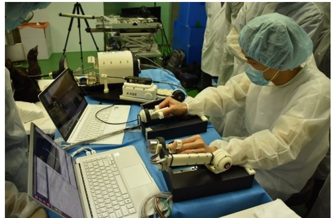
The team conducts a procedure using K-FLEX, flexible endoscopic surgical robot.

K-FLEX is made of domestically produced components, except for the endoscopic module. It will expand new medical robotics research while offering novel therapeutic capabilities for endoscopes.