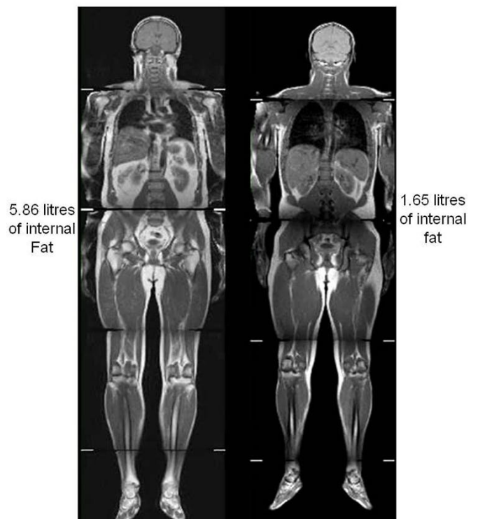
EL Thomas and JD Bell 2008

Different levels of Internal Fat = Different Disease Risks