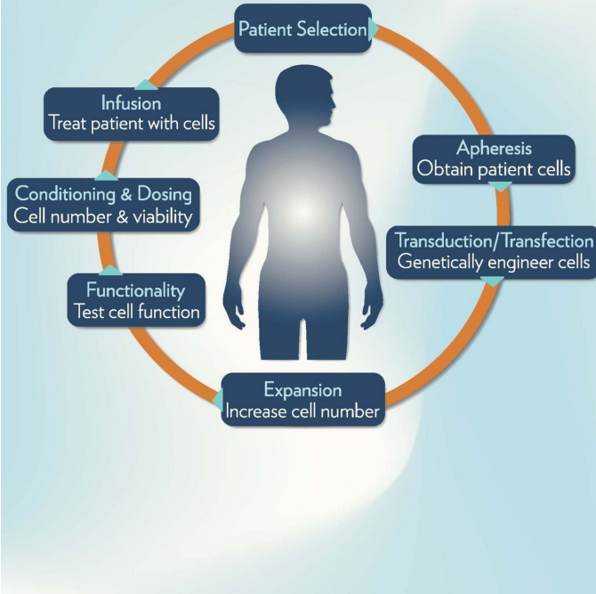
Diagram illustrating the steps of adoptive cell transfer.

In contrast, PIM kinase inhibitors are relative new kids on the block. PIM kinases are proteins that can control many cellular processes, including energy. A clinical roadblock for ACT has been the lack of energy shown by readministered T cells. Mehrotra and his team set out to find whether targeting PIM kinase with an inhibitor could help these readministered cells maintain their energy longer.