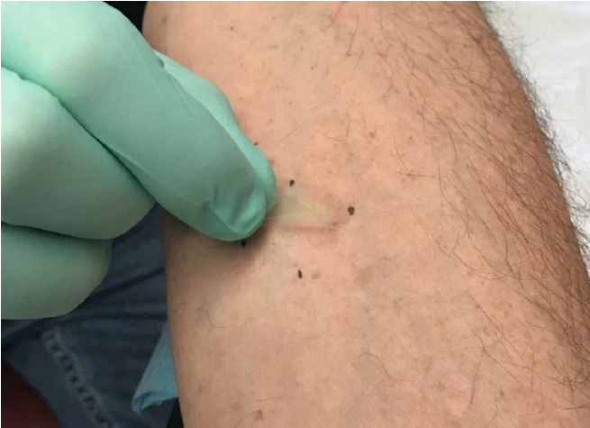
A researcher demonstrates the minimally invasive collection of skin samples using small, clear tape strips.

Atopic dermatitis, a common inflammatory skin condition also known as allergic eczema, affects nearly 20 percent of children, 30 percent of whom also have food allergies. Scientists have now found that children with both atopic dermatitis and food allergy have structural and molecular differences in the top layers of healthy-looking skin near the eczema lesions, whereas children with atopic dermatitis alone do not. Defining these differences may help identify children at elevated risk for developing food allergies, according to research published online today in Science Translational Medicine . The research was supported by the National Institute of Allergy and Infectious Diseases (NIAID), part of the National Institutes of Health.