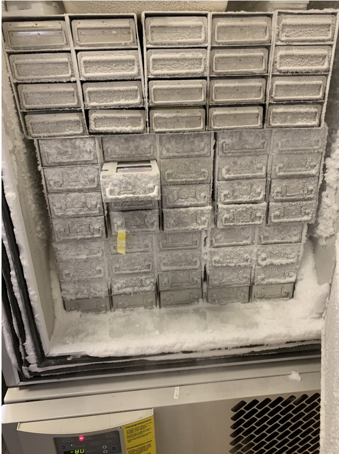
At the University of Pittsburgh, an archive of 15,000 individual phage samples are stored in freezers.

It was a fanciful idea, Hatfull says, and he was intrigued. His phage collection — the largest in the world—resided in roughly 15,000 vials and filled the shelves of two six-foot-tall freezers in his lab. They had been collected from thousands of different locations worldwide—and largely by students.