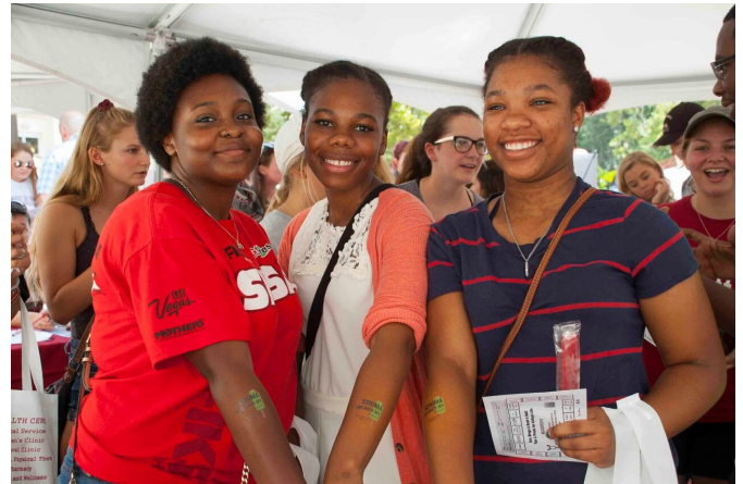
Freshmen show off temporary tattoos with anti-stigma slogans during IU's Welcome Week on Aug. 19, 2016.