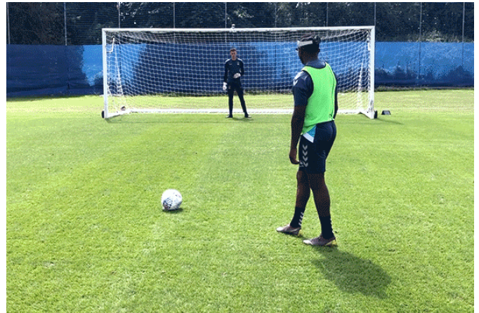
A professional soccer player from a team in the United Kingdom participates in a drill while wearing the sensors.

brain synchrony—crucial for an activity that hinges on coordinated movement.