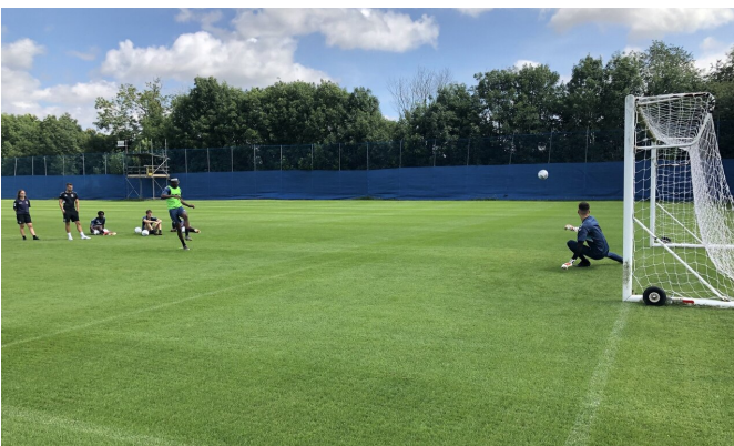
This summer, researchers from the Platt Labs worked with a professional soccer team in the United Kingdom to

"The current gold standard is emailing attendees a survey after the conference, which is a poor measure of engagement," he explains. "We already have exciting results showing social interactions move the needle more than nonsocial ones and that we can, perhaps, make other predictions based on brain activity."