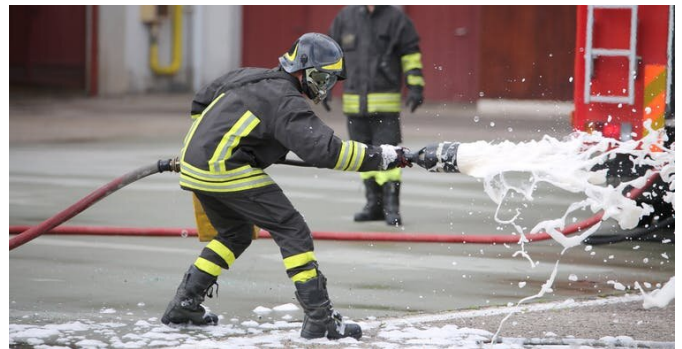
In Australia, the most common source of PFAS is firefighting foam.

We can do longitudinal studies where we follow PFAS exposure and health outcomes in humans over time. But a lack of good exposure monitoring and the difficulty in accounting for other environmental influences makes it hard to reach clear conclusions.