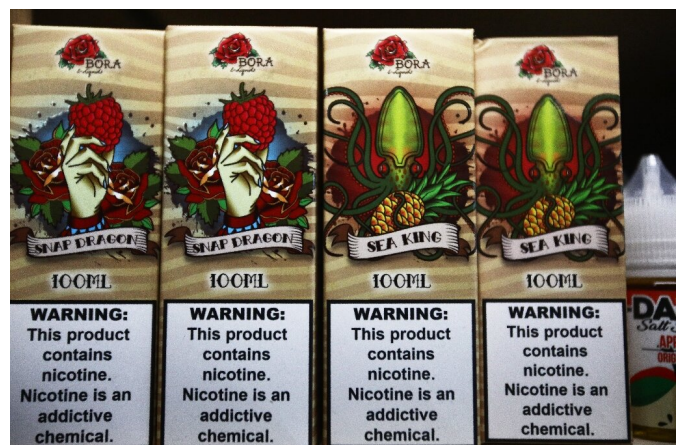
Colorful boxes of e-liquids on display at a vape store, complete with nicotine warning labels

But the bulk of this research was carried out before the current outbreak of severe lung disease in the United States, with more than 450 cases currently under investigation.