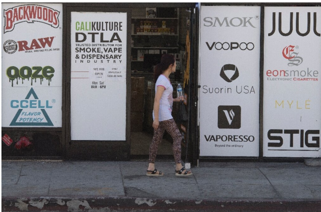
This Los Angeles vaping store advertises the main brands offered by the e-cigarette industry

That said, it's unclear why these cases have only been reported in the United States, and whether they are even new, or only being recognized after earlier misdiagnoses.