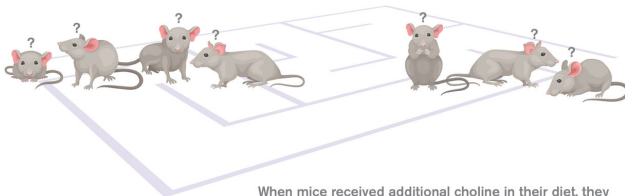
When mice received additional choline in their diet, they showed marked improvement in cognitive performance.

Choline reduces the activation of microglia. Overactivation of these housekeeping cells in the brain is linked with neurodegeneration.