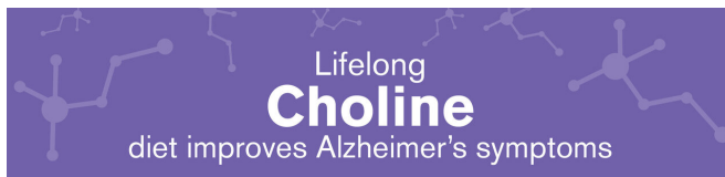
Female mice bred to display Alzheimer's-like symptoms develop progressive cognitive decline.