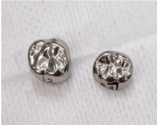
Metal crowns used in the Hall technique.

After three years, there was no evidence of a difference between the groups for pain, infection, quality of life or dental anxiety. All methods were acceptable to children, parents and dental professionals. However, when considering the slightly higher number of episodes of dental pain and infection in the prevention-alone group, and the overall cost of subsequent treatment, the sealing in with prevention strategy was the most cost-effective treatment.