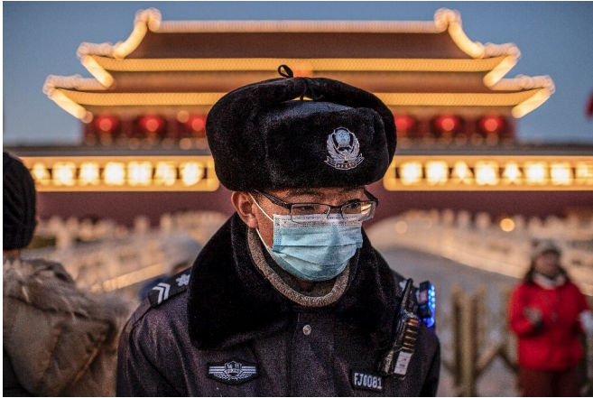
Misinformation about the mystery virus has spread widely since its outbreak in China