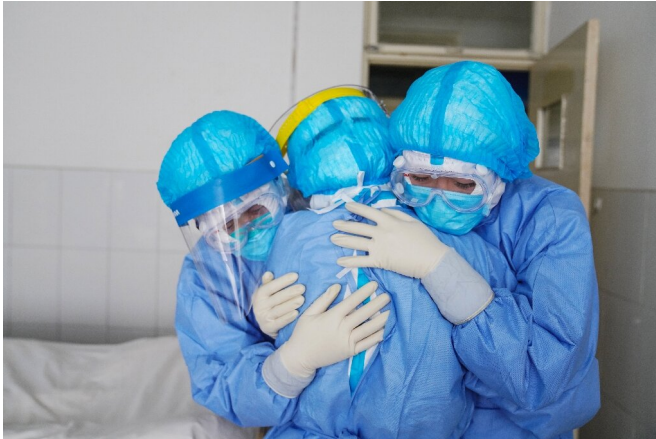
Medical staff hug each other in an isolation ward at a hospital in Zouping in China's eastern Shandong province

Authorities in China warned Wednesday they faced a severe shortage of hospital beds and equipment needed to treat a growing number of patients stricken by the new coronavirus, as cities far from the epicentre tightened their defences.