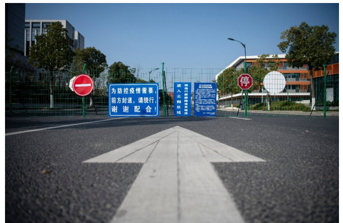
A barrier to stop traffic is seen near the Alibaba headquarters in Hangzhou, southwest of Shanghai—the operations of many major companies have been affected by the coronavirus outbreak