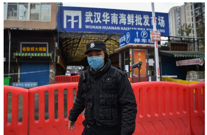
The coronavirus is believed to have emerged from the Huanan market in Wuhan, where wild animals were sold

Thousands of Chinese tourists risked being stranded in Bali after the Indonesian government suspended flights to and from mainland China.