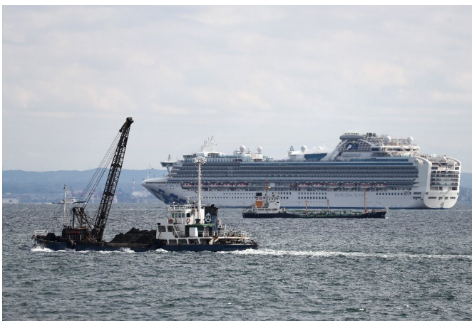
Japan has quarantined a cruise ship carrying 3,711 people and was testing those on board for the new coronavirus

At least three other cities in Zhejiang province—Taizhou, Wenzhou and parts of Ningbo—have imposed the same measures, affecting 18 million people.