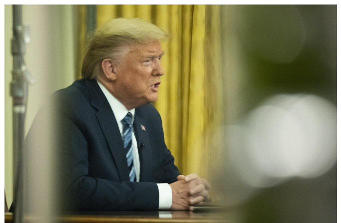
President Donald Trump addresses the nation from the

"It may get a little bigger; it may not get bigger at all," Trump said in a national TV address at the time.