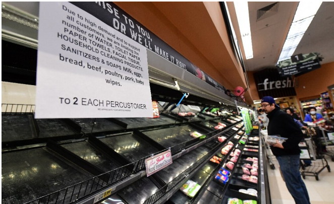
A sign announces a two-item limit for certain items as people shop for food in Monterey Park, California

Trump acknowledged the United States "may be" heading into a recession due to the virus, as G7 leaders vowed to coordinate their response to the virus and "do whatever it takes, using all policy tools"—after a meeting held via videoconference.