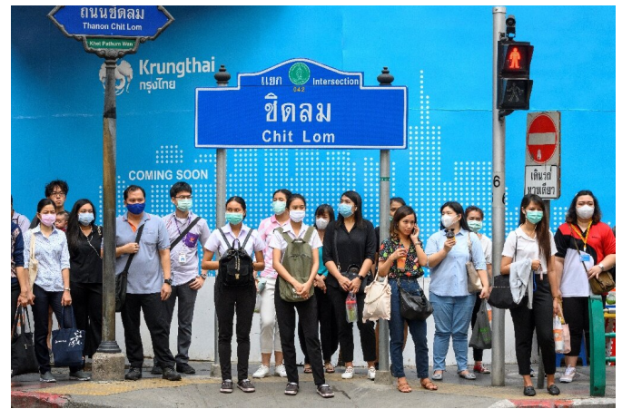
Very few countries have been left untouched by the virus as it continues its relentless march across the globe, and a cascading number are taking increasingly drastic responses

Britain called for an end to all "non-essential" contact and travel, while Switzerland declared a state of emergency.