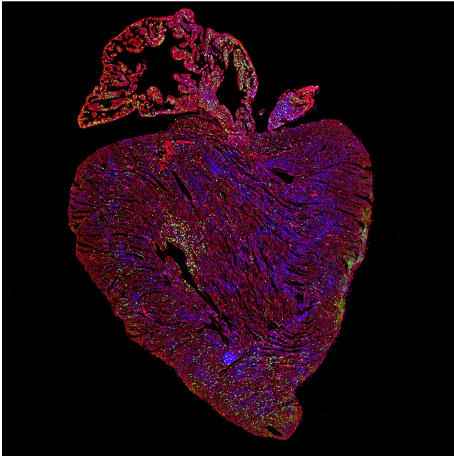
Adult mouse heart after activation of both proteins vital for cell replication. Green shows cells replicating.

Researchers trying to turn off a gene that allows cancers to spread have made a surprising U-turn. By making the gene overactive and functional in the hearts of mice, they have triggered heart cell regeneration. Since adult hearts cannot usually repair themselves once damaged, harnessing the power of this gene represents major progress towards the first curative treatment for heart disease.