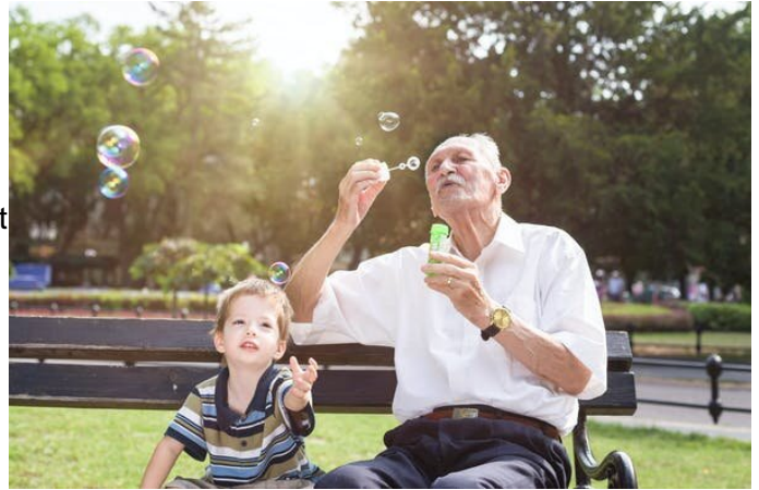
Older people's immune systems respond very differently to children's.

In some cases, medications that work to suppress the immune system have successfully treated this excessive immune response in people with COVID-19.