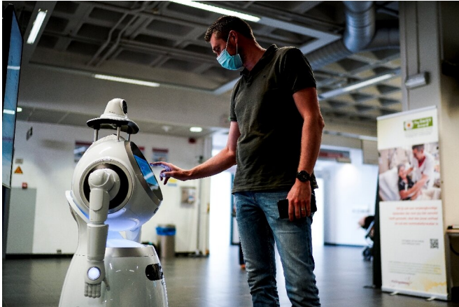
The robot greeting patients and taking temperatures at Antwerp University Hospital

When Belgian patients fear they have caught coronavirus and head to Antwerp University Hospital, the first face they see isn't a masked triage nurse—but a one-eyed vaguely humanoid robot.