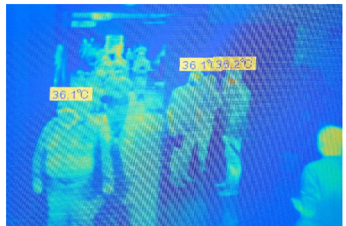
The robot's screen, showing the temperatures of the people it can see

Fabrice Goffin, joint-CEO of Zorabots, explained the thinking behind the android assistant, and explained why its interface—with a mask detecting sensor—is better than a touchscreen at the door.