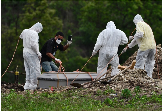
A man films with a mobile phone as he helps bury a victim of COVID-19 at a cemetery on the outskirts of Tegucigalpa, Honduras

Surging fatalities in Latin America helped push the global coronavirus death toll above 400,000 on Sunday, even as Europe emerged from its virus lockdown with infections increasingly under control there.