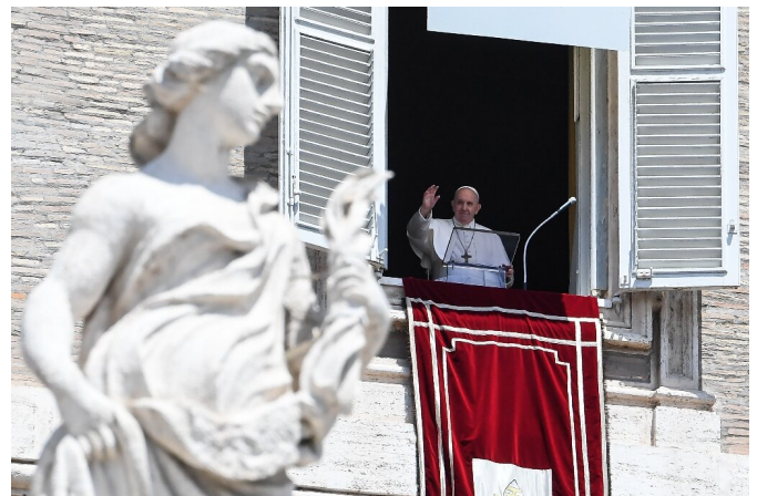
Pope Francis said the worst of the coronavirus crisis was over in Italy as he addressed the faithful for the first time in Saint Peter's Square