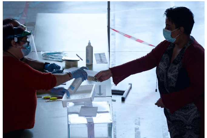
Strict hygiene measures were in place for regional elections in Spain

In Paris, demonstrating nightclub workers demanded a re-opening of their venues, arguing that strictly-controlled club visits would be safer than unregulated beach parties.