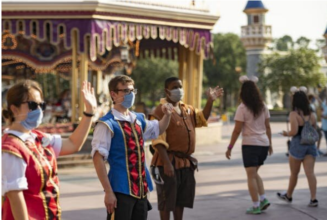
Disney World reopened on July 11 with face mask requirements.

are present; we cannot guarantee you will not be exposed during your visit."