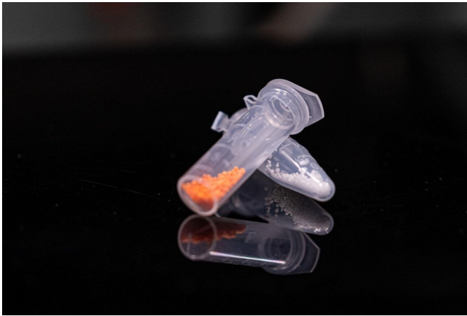
NTU Singapore scientists develop new timed-release microcapsules that can float in the stomach and release drugs over time.

Medication for the treatment of PD has an estimated pharmaceutical market size of US$8.38 billion by 2026, as reported by Fortune Business Insights in 2019.