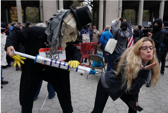
Anti-lockdown protesters in New York, where officials warned a surge in coronavirus cases may lead to new restrictions being imposed

Canada's biggest city entered lockdown on Monday in the latest bid to curb coronavirus infections, with case numbers surging across North America even as US officials said vaccinations could be available within weeks.