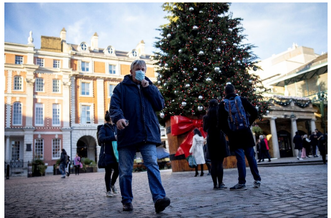
Pedestrians in face masks walk past a Christmas tree in London's Covent Garden

The United States could begin its own vaccination program as soon as next month, raising hopes of a looming end to the pandemic in the world's worst-hit nation.