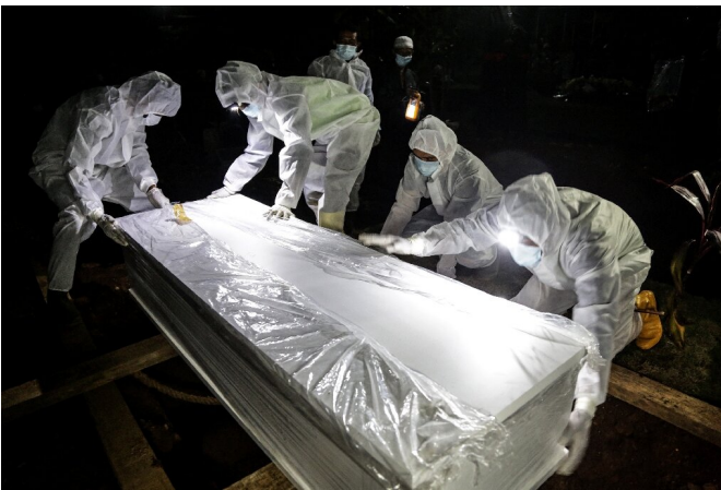
Graveyard workers in full protective gear move a coffin in Bogor, Indonesia

But top infectious disease expert Anthony Fauci warned the country's outbreak could get worse before getting better if people failed to take precautions in the coming holiday season.