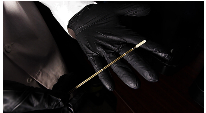
3D printed swab.