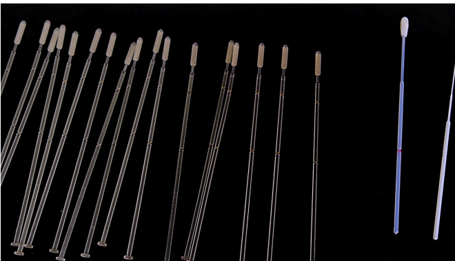
3D printed swabs.