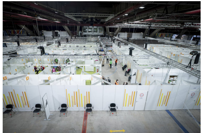
People stay in the new open Erika-Hess-Eisstadion vaccine center in Berlin, Germany, Thursday, Jan. 14, 2021.

While restaurants, most stores and schools have already been closed and those shutdowns are likely to be extended, there's also talk about possible nightly curfews, an obligation to wear the more effective FFP2 or KN95 masks on public transportation, and a push to get more people to work at home to avoid office-driven infections.