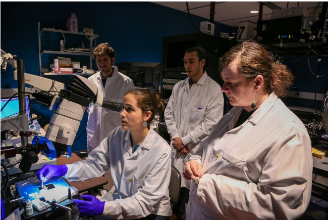
Allen Institute researchers prepare for a Neuropixels experiment.