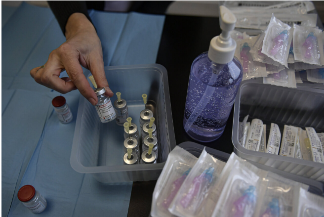
A health worker prepares Moderna coronavirus vaccines before vaccinating staff health workers at Clinica Universitaria, in Pamplona, northern Spain, Wednesday, Jan. 20, 2021.

Amid another COVID-19 surge, Spanish health authorities are running out of vaccines and have been forced to postpone giving shots to health workers and nursing home residents due to delays in deliveries by pharmaceutical companies.