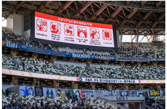
Virus safety rules are already in place in Japan for major sports events