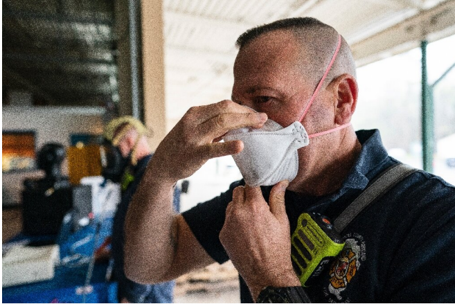
A firefighter with Anne Arundel County Fire Department in Maryland tests his N-95 mask

As new, more transmissible variants of the coronavirus spread, experts say it's time to consider using a medical-grade respirator, or wearing a surgical and cloth mask together.