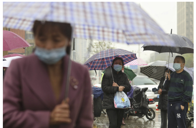
People wearing face masks to protect against COVID-19 wait in the rain to pick up children from a school in Wuhan in central China's Hubei Province, Friday, March 26, 2021. Chinese officials briefed diplomats Friday on the ongoing research into the origin of COVID-19, ahead of the expected release of a long-awaited report from the World Health Organization.

Dr. Anthony Fauci said the explanation that "most public health officials agree with" about how COVID-19 appeared in humans is that the virus was likely spreading in China below the radar for several weeks, allowing it to be well adapted by the time it was recognized.