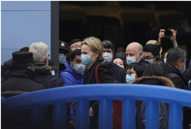
In this Jan. 31, 2021, file photo, the World Health Organization team is briefed outside of the Huanan Seafood Market on the third day of their field visit in Wuhan, China. Chinese officials briefed diplomats Friday, March 26, 2021, on the ongoing research into the origin of COVID-19, ahead of the expected release of a long-awaited report from the World Health Organization.

Separately, Foreign Ministry spokesperson Hua Chunying said, "I would like to stress that virus tracing is a scientific issue that should be studied by scientists through cooperation."