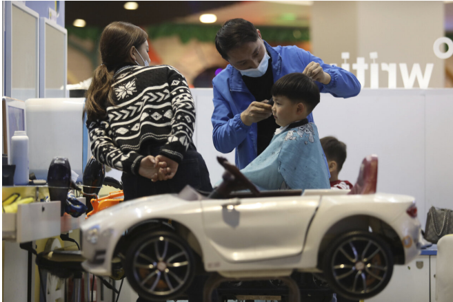
A stylist wearing a face mask to protect against COVID-19 cuts a child's hair in Wuhan in central China's Hubei Province, Friday, March 26, 2021. Chinese officials briefed diplomats Friday on the ongoing research into the origin of COVID-19, ahead of the expected release of a long-awaited report from the World Health Organization.

Chinese officials briefed diplomats Friday on the ongoing research into the origin of COVID-19, ahead of the expected release of a long-awaited report from the World Health Organization.