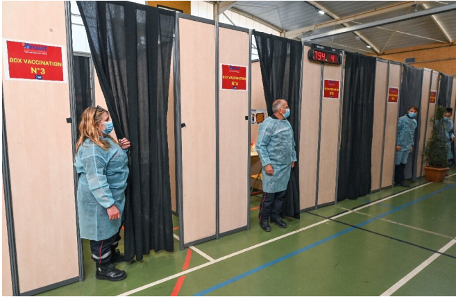
France's vaccine rollout has been punctured by rows over the jabs

Europe's stuttering vaccine rollout faced multiple hurdles on Friday as EU regulators said they were reviewing side effects of the Johnson & Johnson shot and France further limited its use of the AstraZeneca jab.