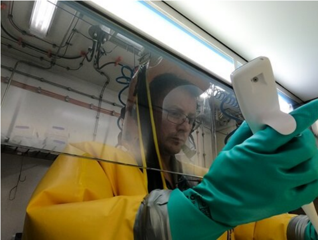
A scientist working under high-containment at CSIRO's Australian Centre for Disease Preparedness in Geelong, Victoria.

CSIRO, Australia's national science agency, played an important role in evaluating heat-tolerant COVID-19 vaccine formulations developed by the Indian Institute of Science (IISc) and biotech start-up Mynvax—against all current SARS-CoV-2 variants of concern.