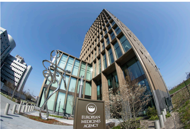
Exterior view of the European Medicines Agency, EMA, in Amsterdam's business district, Netherlands, Tuesday,

Earlier this month, the EMA said it began evaluating the use of Moderna Inc.'s COVID-19 vaccine for children ages 6 to 11; it estimated that a decision would be made within two months.